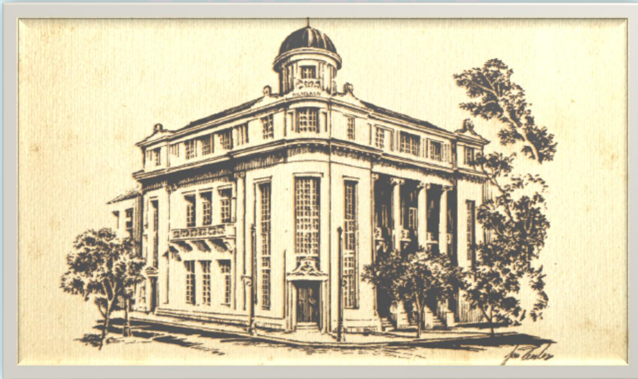
Headquarters Pará Trade Association