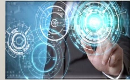
TECHNOLOGY AND INNOVATION